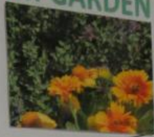
Higganum Green Gardens