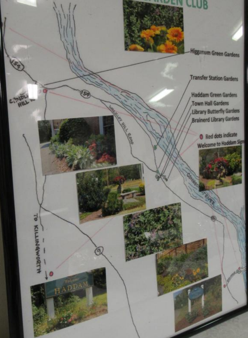
Transfer Station Gardens